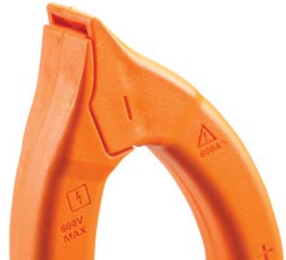
Figure 1. The unique wire separator allows you to separate and measure individual wires more easily

Ergonomically built, the U1190 Series clamp meters fit comfortably in the palm of your hand and allow you to select measurement functions with just a simple thumb press. Better yet, the U1193A and U1194A come with a current measurement up to 600 A. The wide range of current measurement functions cover an array of applications such as electrical installation, maintenance, and troubleshooting tasks—making it an ideal tool to use across many industrial applications.